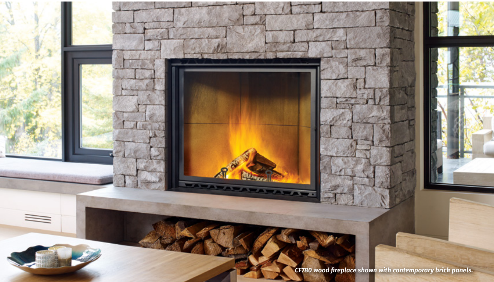
CF780 wood fireplace shown with contemporary brick panels.