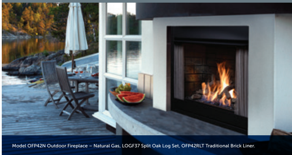
Model OFP42N Outdoor Fireplace – Natural Gas, LOGF37 Split Oak Log Set, OFP42RLT Traditional Brick Liner.

Two fireplace choices and no venting required.