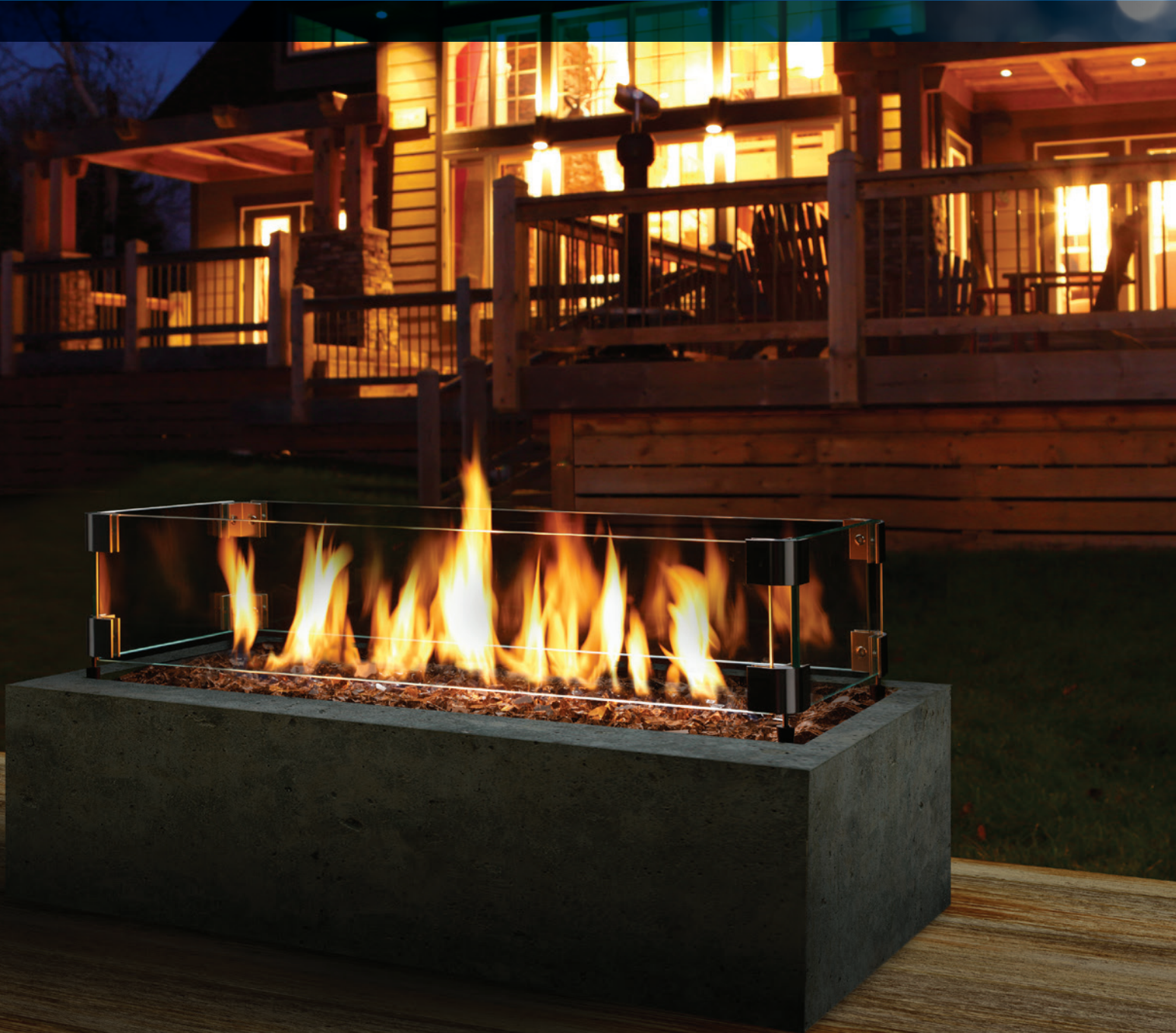
OB48MVN Linear Burner – Millivolt – Natural Gas, Z5GC Decorative Bronze Glass x4, OB48WG Wind Guard.