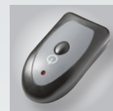
Black and Grey Remote Millivolt (On/Off)

Plus, adding decorative glass, cannonballs and wind guard options ensure you create the look you want. When you have achieved your desired look, invite family and friends to gather around for a perfect get together outdoors.