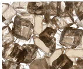
1/2" Bronze (5 lbs)

REQUIRED: 5 lbs per foot of burner (ie: 24" burner = 10 lbs)