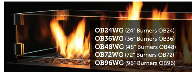
5 1/2" Height

OB24WG (24" Burners OB24) OB36WG (36" Burners OB36) OB48WG (48" Burners OB48) OB72WG (72" Burners OB72) OB96WG (96" Burners OB96)