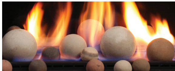
Assorted size and colors (14 pc)